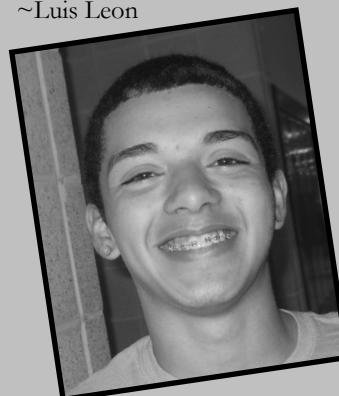
"Dorney Park."