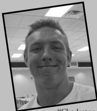
"Charleston, S.C."