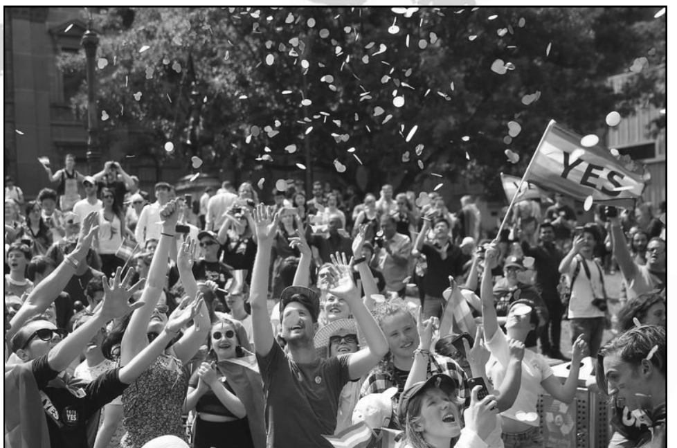
Australians celebrate the results of the vote for same-sex marriage.