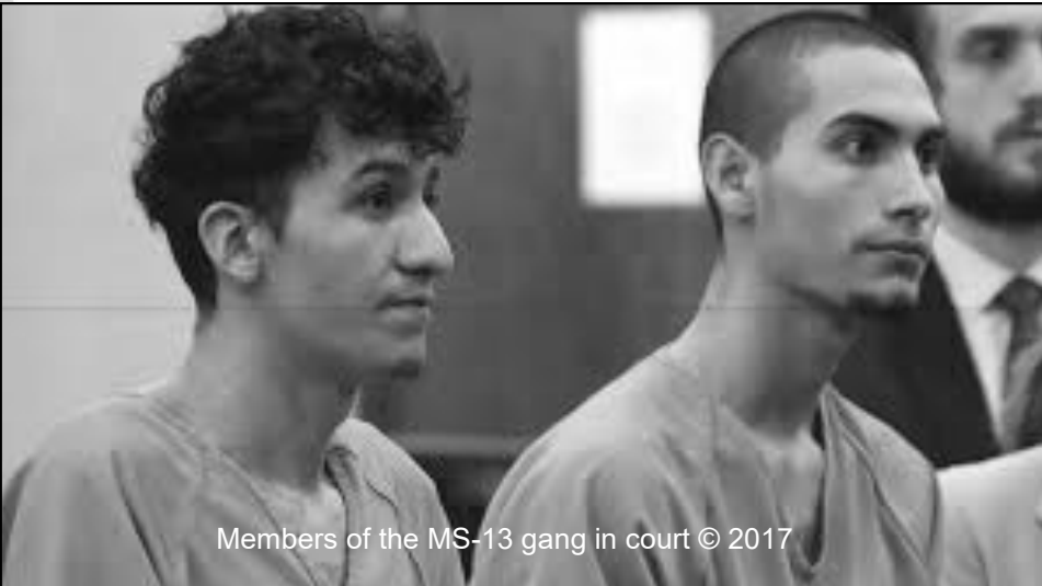
Members of the MS-13 gang in court © 2017