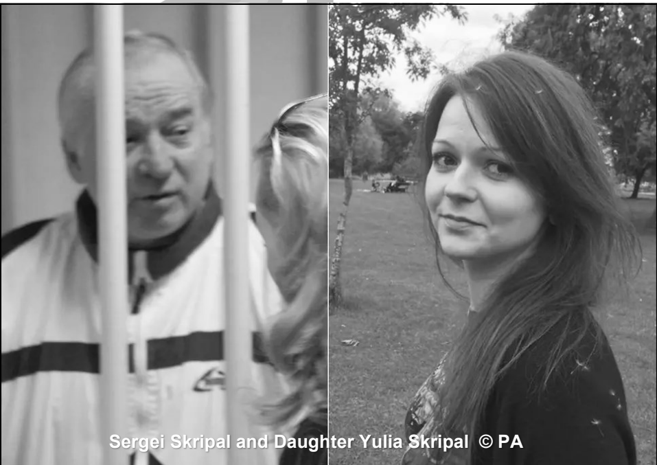
Sergei Skripal and Daughter Yulia Skripal